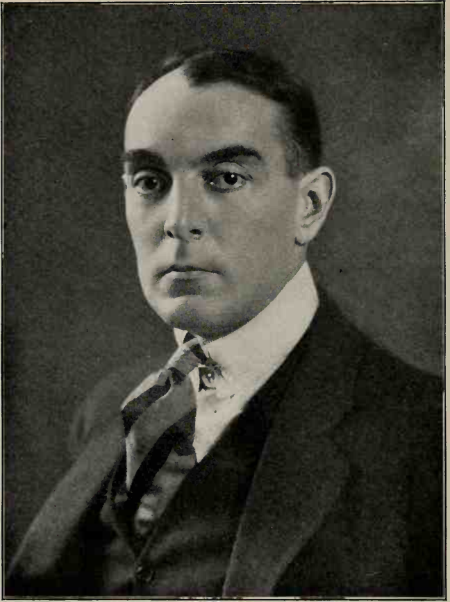
Ring W. Lardner